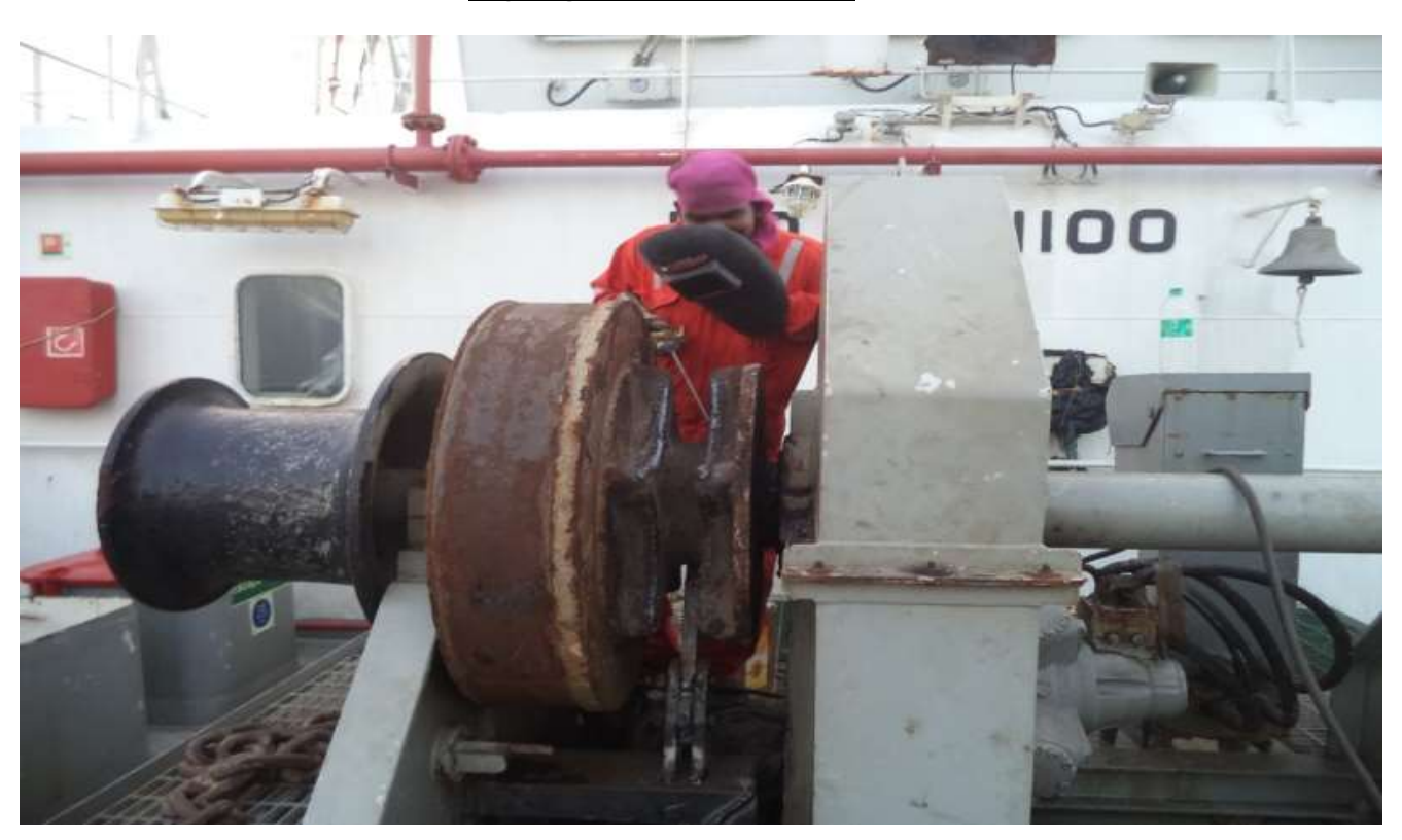
Windlass Gypsy repairs.